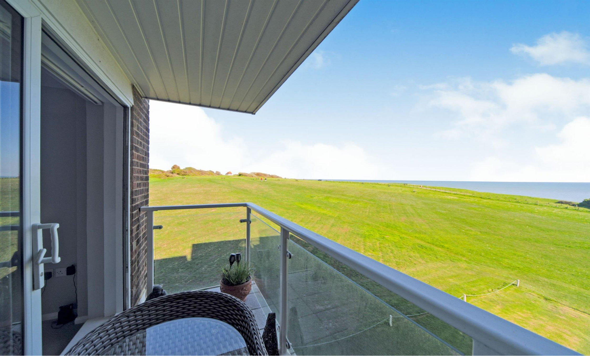
Wallington Towers Sutton Place, Bexhill-On-Sea TN40 1PQ