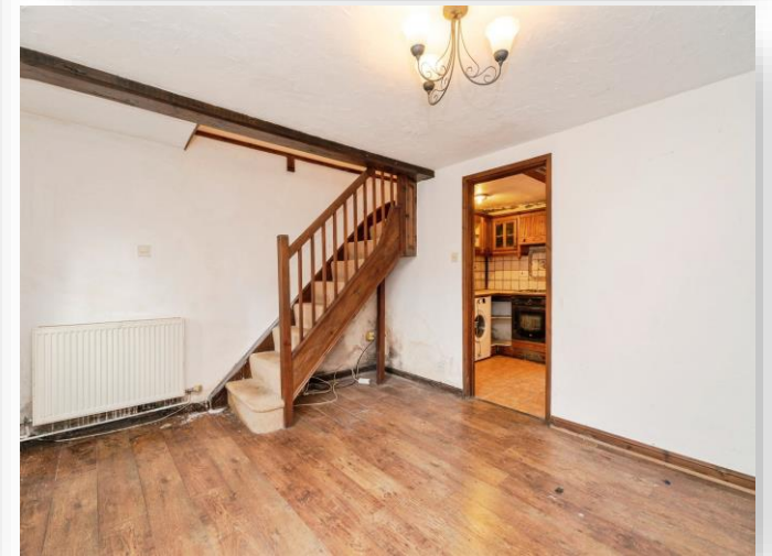
Dukes Yard, West Rudham King's Lynn PE31 8RP