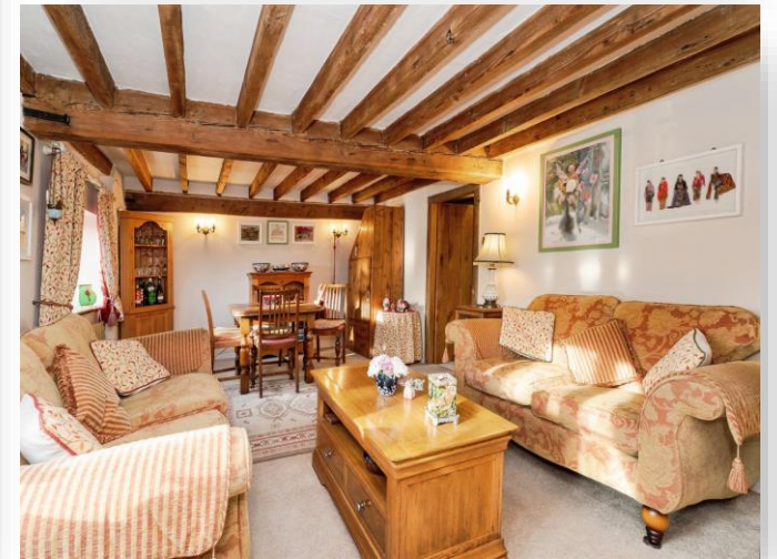
Flintstones 3 Swan Street,Fakenham NR21 9BN