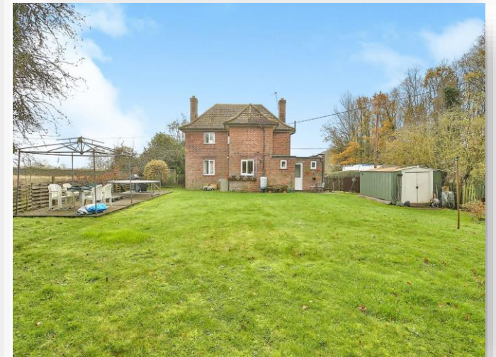
The Old Police House, Weasenham, KING'S LYNN, PE32 2SN