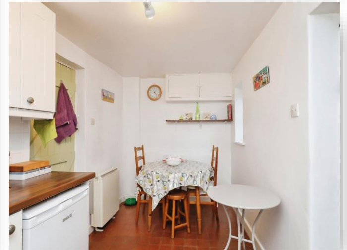
Corner Cobbles The Green, Weasenham King's Lynn PE32 2TD