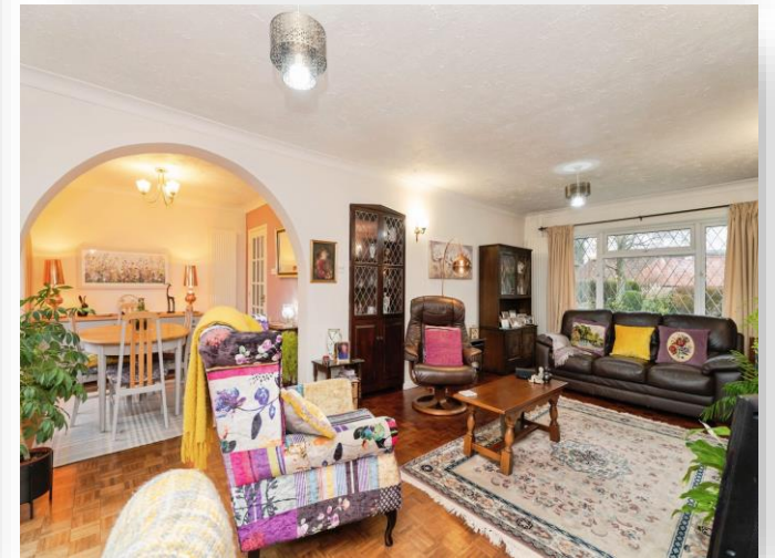
Greenside Clarks Lane, Thursford Fakenham NR21 0BS