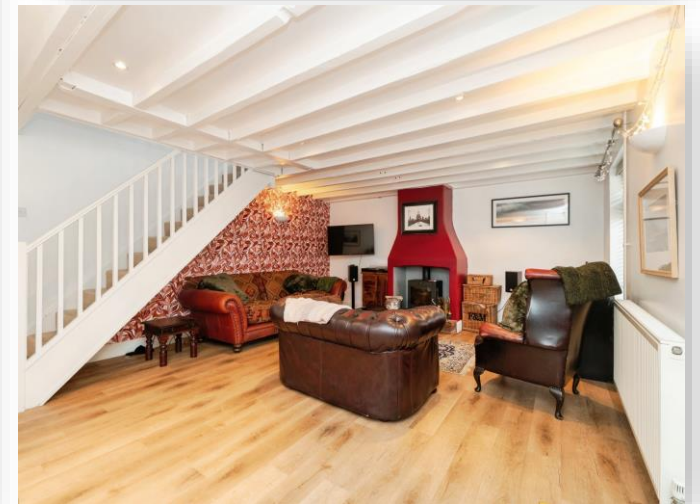
Grey House 25 Station Road, Foulsham Dereham NR20 5RD