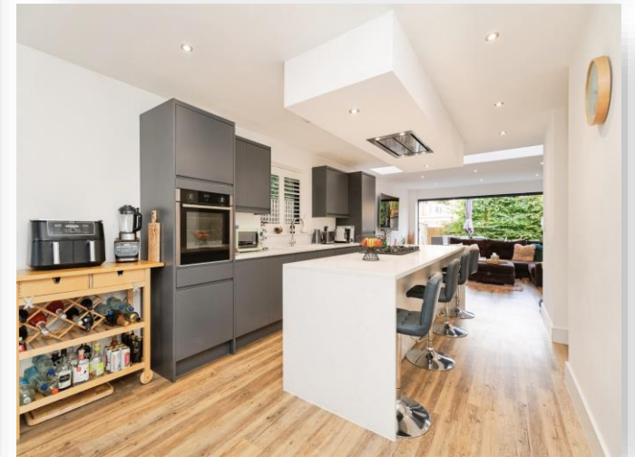
The Mews, Fakenham NR21 8HB