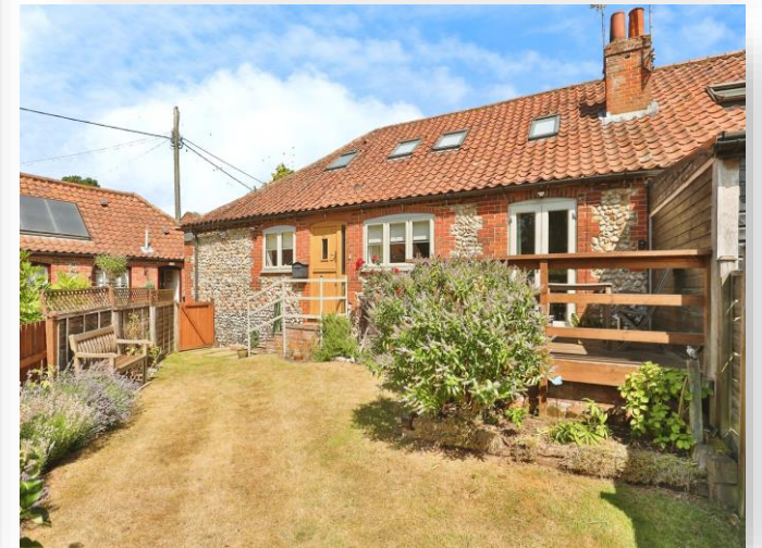
Manor Court The Street, Syderstone King's Lynn PE31 8SD