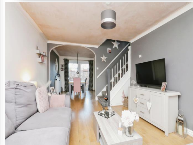
The Ridings, Fakenham NR21 8PE