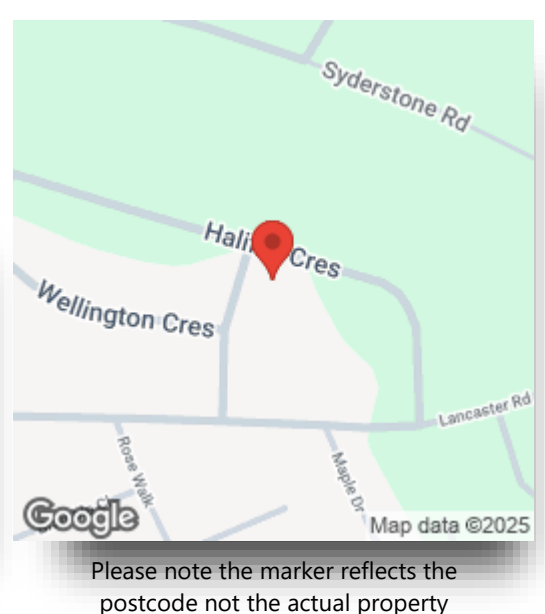
view this property online williamhbrown.co.uk/Property/FKM108141