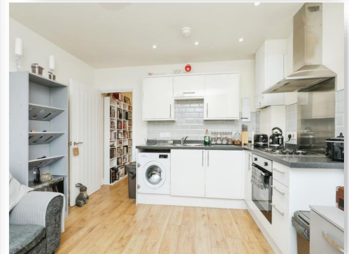
Summit House Holt Road, Fakenham NR21 8ED