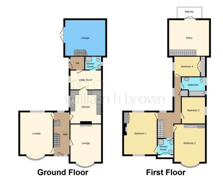
This floor plan is for illustrative purposes only. It is not drawn to scale. Any measurements, floor areas (including any total floor area), openings and orientation are approximate. No details are guaranteed, they cannot be relied upon for any purpose and they do not form part of any agreement. No liability is taken for any error, omission or misstatement. A party must rely upon its own inspection(s). Devered by www.foredept.