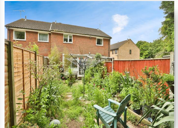
Norman Close, Fakenham NR21 9RX