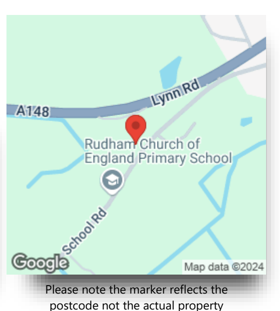
view this property online williamhbrown.co.uk/Property/FKM107847