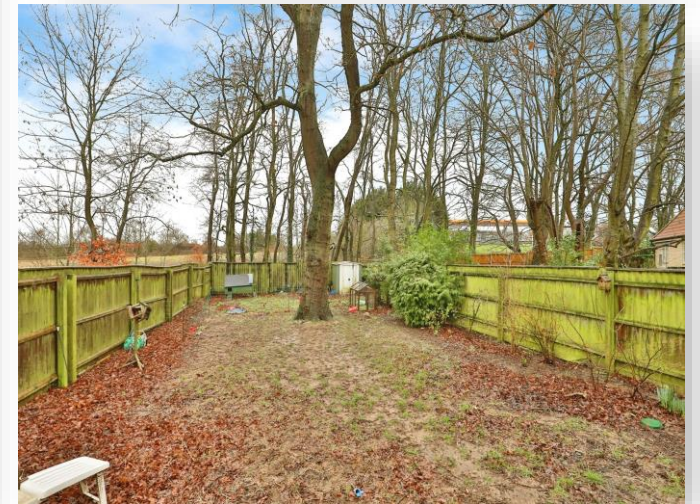
Oak Tree Cottage Sandy Lane, Fakenham NR21 9EX