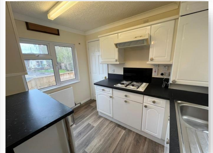
Star Meadow Oak Street, Fakenham NR21 9DS