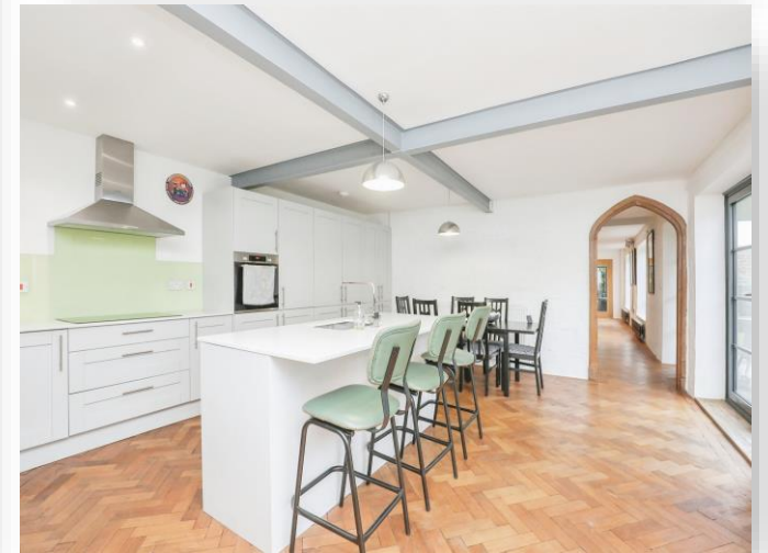
The Old Coach House 19 Gladstone Road, Fakenham NR21 9BZ