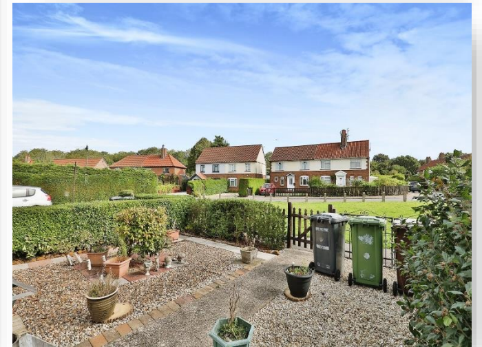
Jubilee Avenue, FAKENHAM NR21 8DG