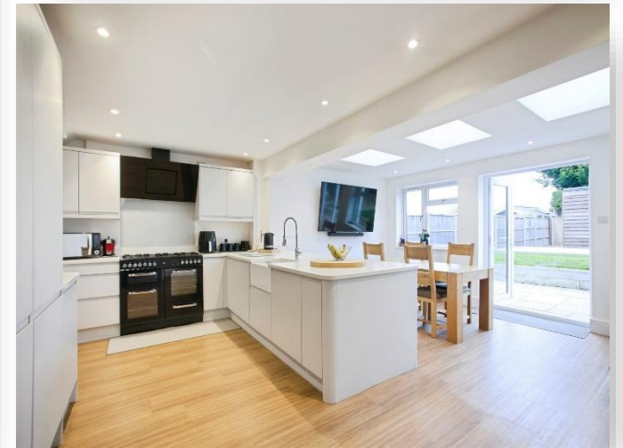
30 Raleigh Crescent, Amesbury Salisbury SP4 7QE