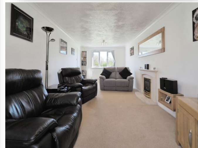
4 Yewtree Close, Durrington Salisbury SP4 8NG