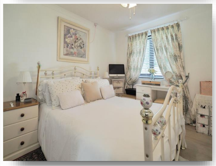
Flat 21, Countess Court, London Road, Amesbury, SP4 7ER