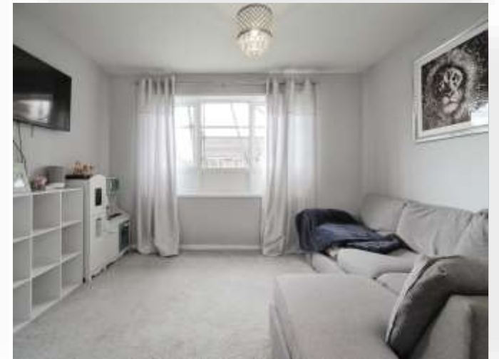
Paddock Close, Enford Pewsey SN9 6DN