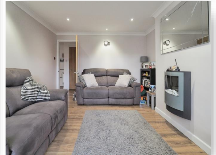
5 The Drove, Amesbury Salisbury SP4 7AG