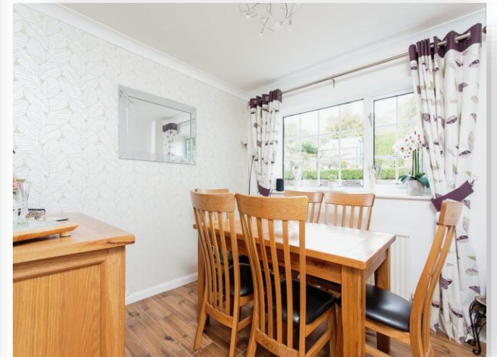
Isa-Lei, Amesbury Road, Shrewton Salisbury SP3 4HD