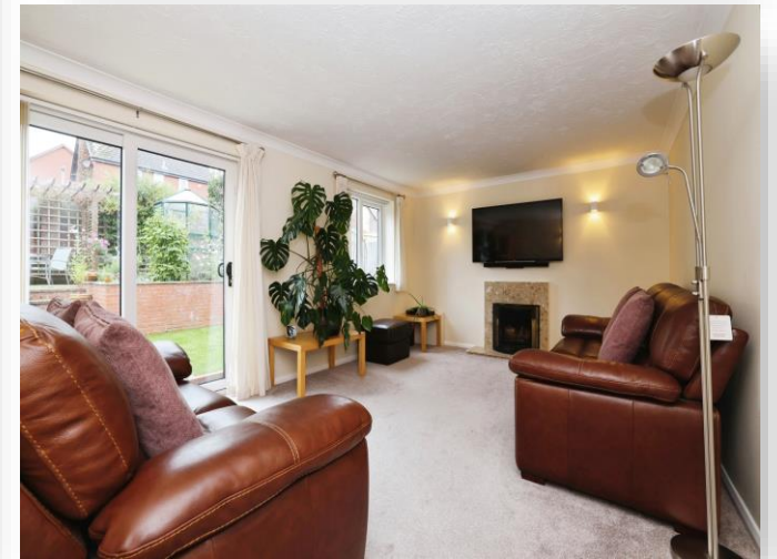
14 Heron Walk, Durrington Salisbury SP4 8LH