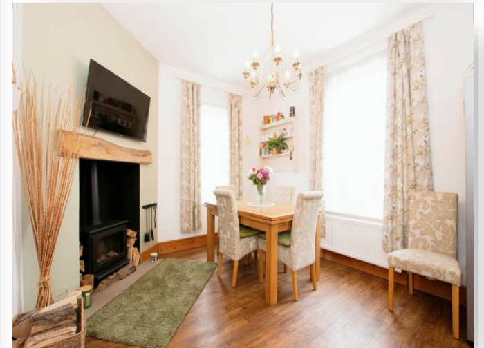
Bulford Road, Durrington Salisbury SP4 8EU