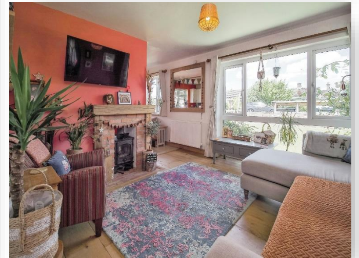
4 Downs View Close, Haxton, Salisbury SP4 9PS