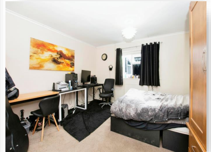
Devereux Road, Amesbury SALISBURY SP4 7NW