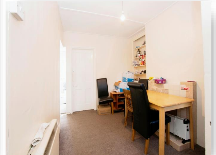
Bulford Road, Durrington SALISBURY SP4 8DL