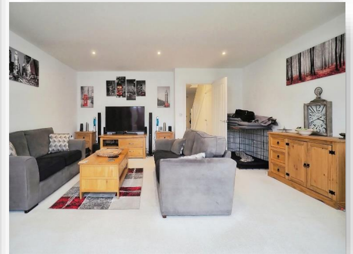
Hunter Close, Amesbury SALISBURY SP4 7YS