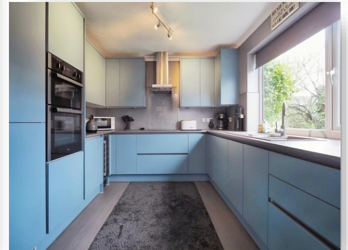
The Limes, Porton Salisbury SP4 0LT