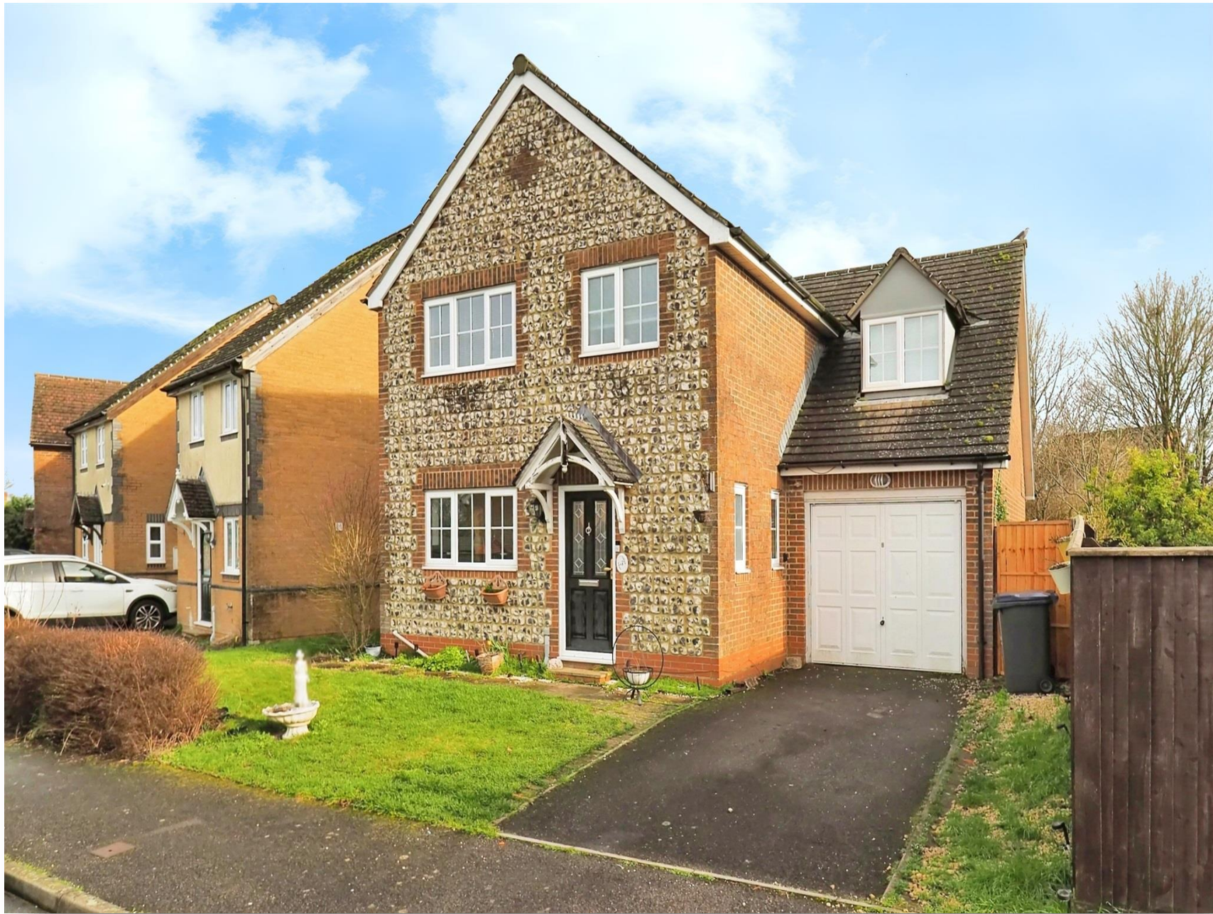
Simmance Way, Amesbury Salisbury SP4 7TD