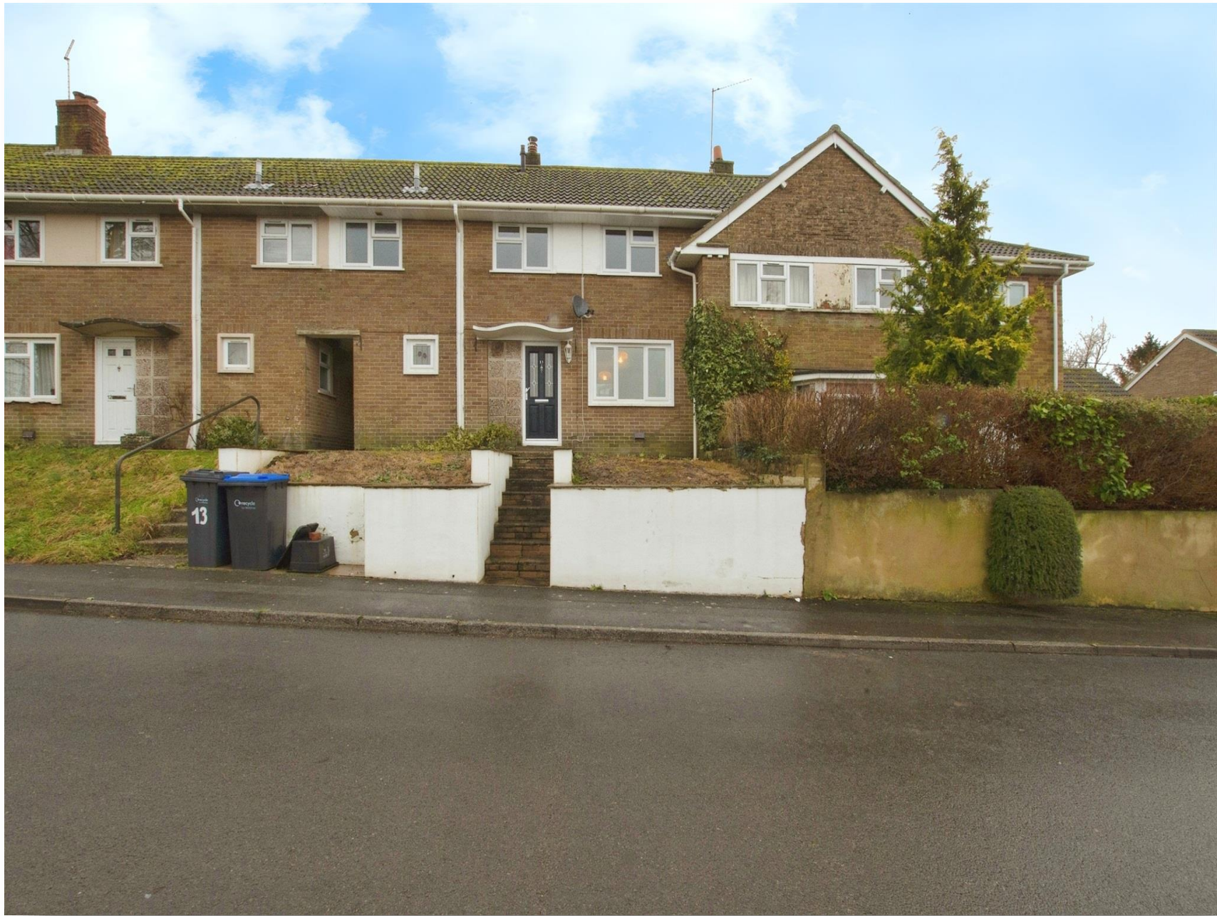
Imber Place, Tilshead Salisbury SP3 4SE