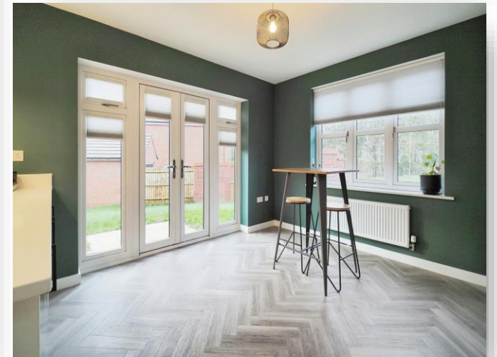
1 Brockway Close, Amesbury Salisbury SP4 7DU