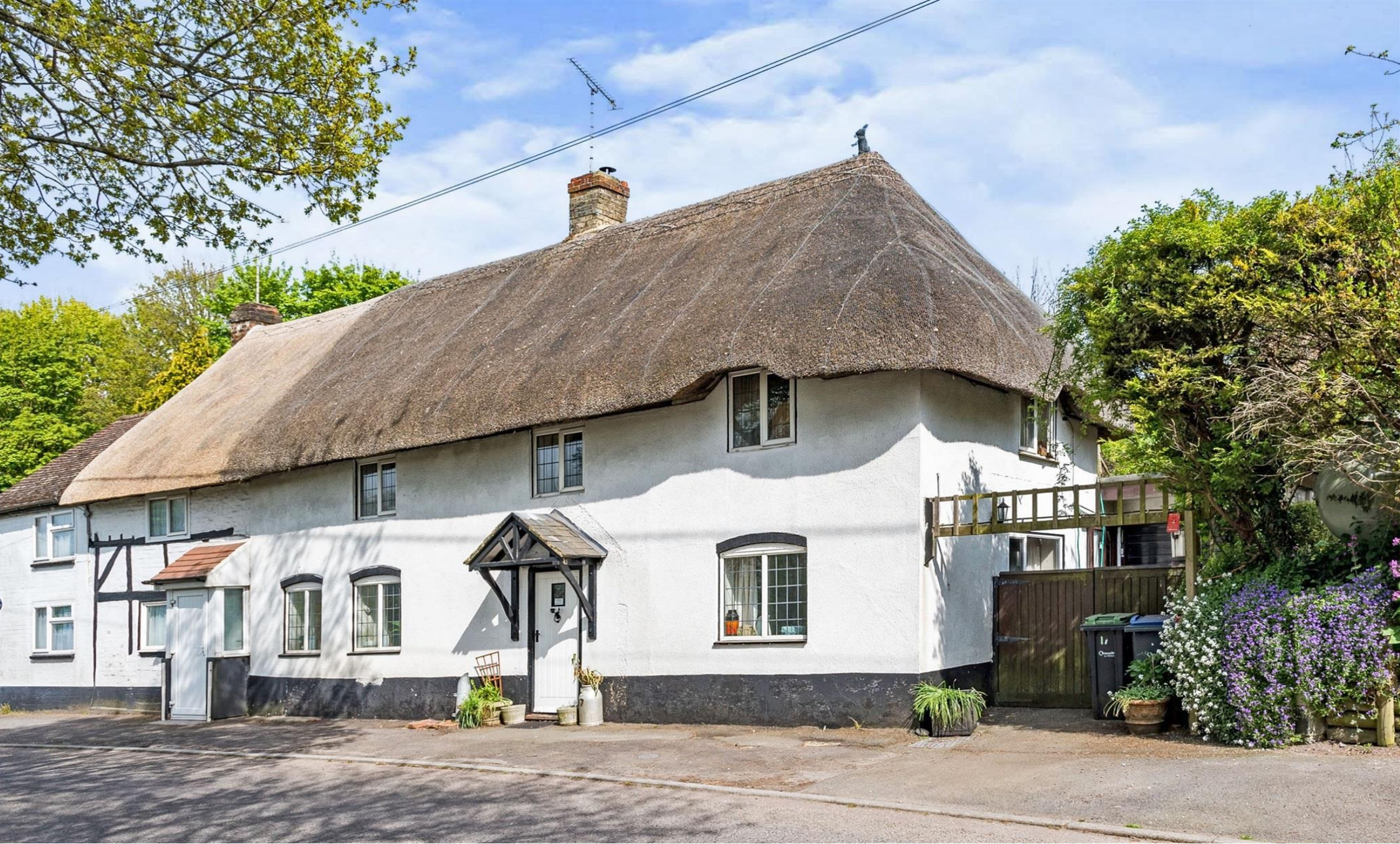
Apple Tree Cottage, Ludgershall Road, Collingbourne Ducis Marlborough SN8 3EJ