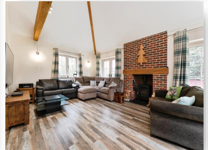
Brangehill Lane, Mepal, Ely CB6 2AL