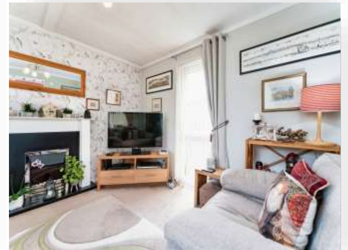
61 The Drove Bedwell Park, Witchford Ely CB6 2JT