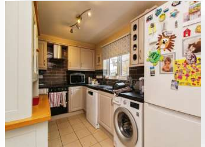
12 Heron Croft, Soham Ely CB7 5UT