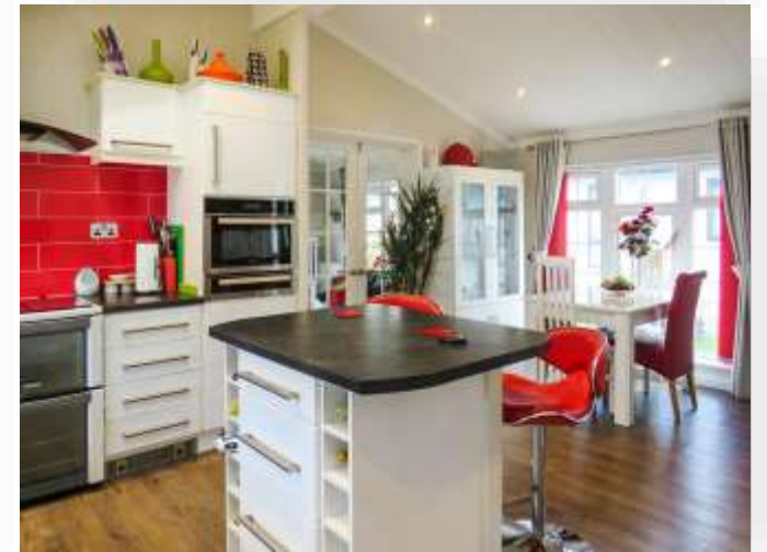
Bluebell Woods Ely Road, Waterbeach Cambridge CB25 9NW