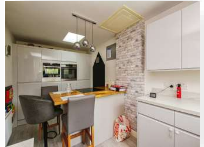
278 Kings Avenue, Ely CB7 4PJ