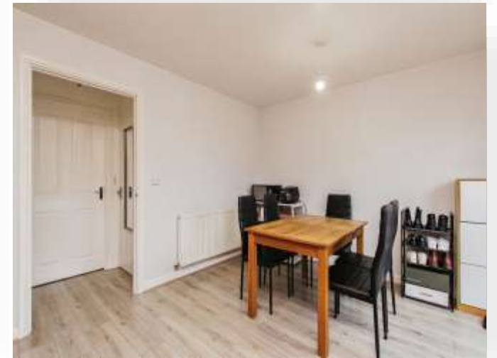
8 The Leap, Littleport Ely CB6 1FR