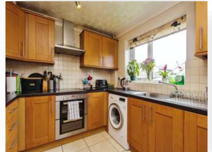
44 Vermuyden Gardens, Sutton Ely CB6 2QR