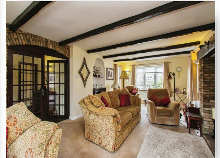
High Street, Wilburton Ely CB6 3RA