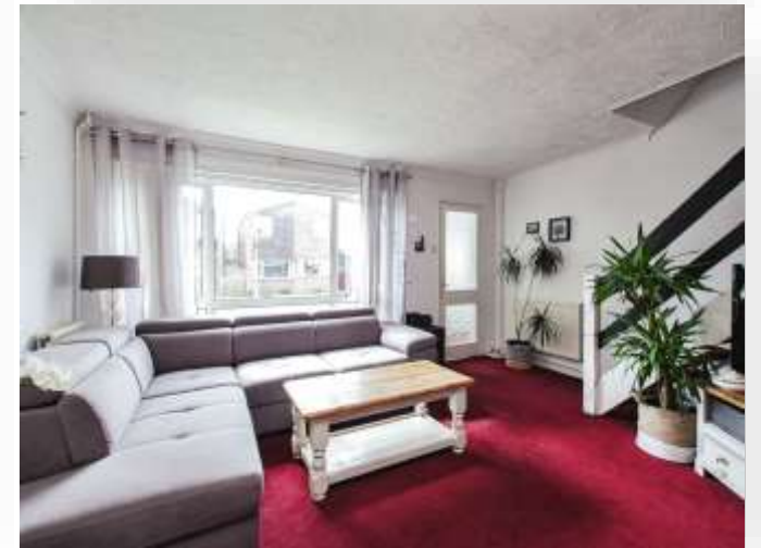
16 Yorke Way, Ely CB6 3DT