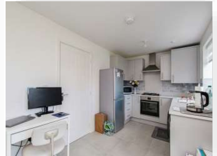
20 Paddocks Greenway, Littleport Ely CB6 1LS