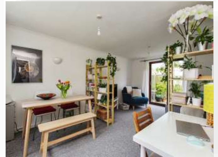
7 Townsend Mews, Wilburton Ely CB6 3SQ