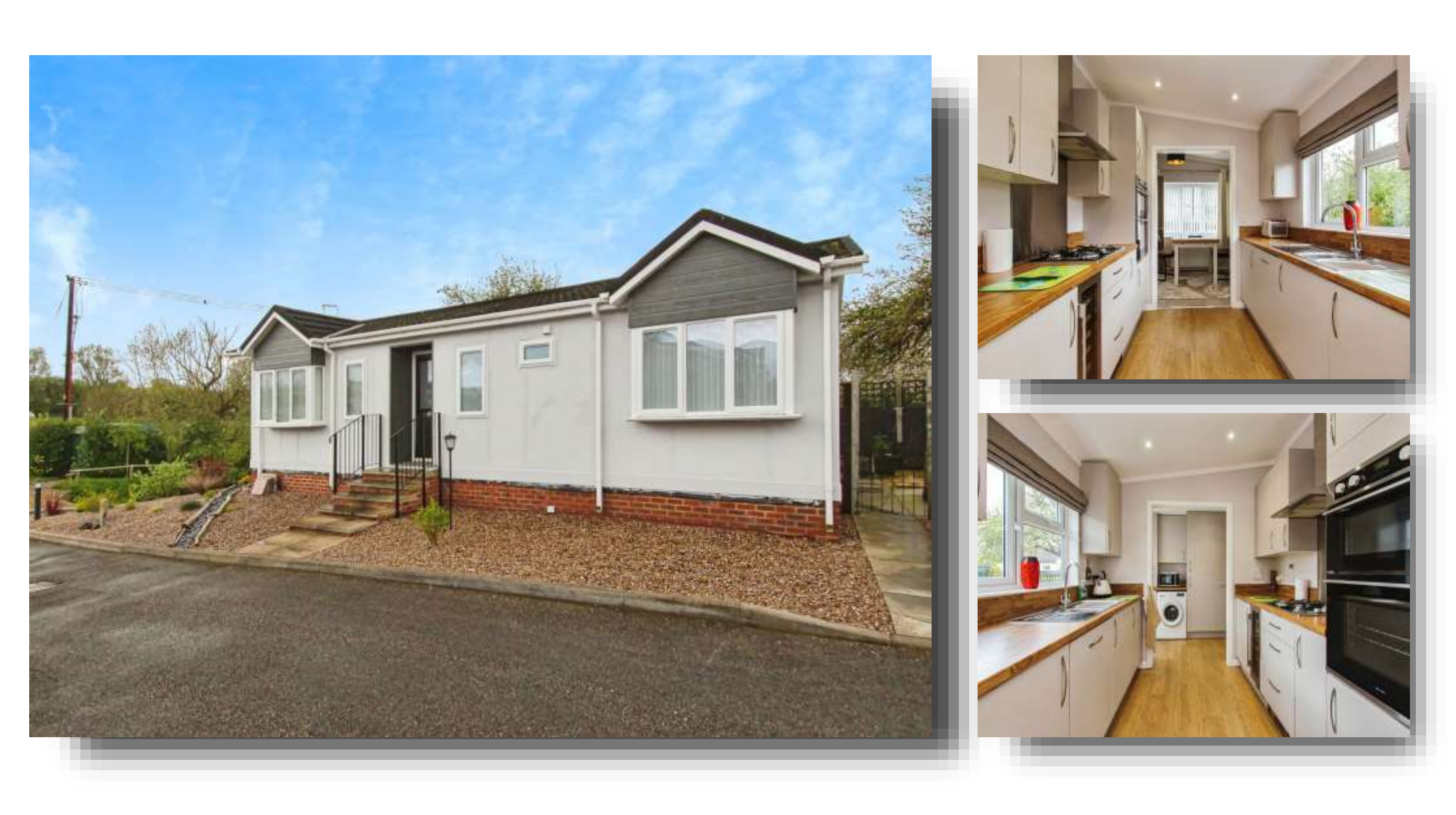
11 The Lanterns Bedwell Park, Witchford Ely CB6 2FH