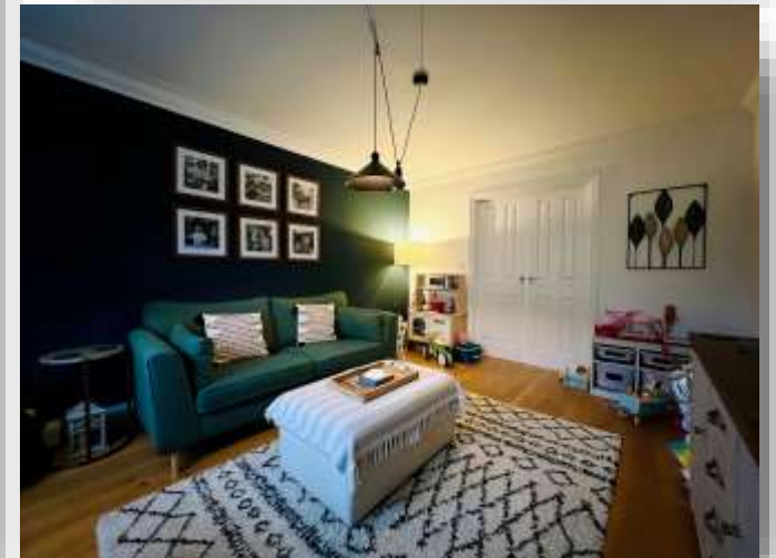
Cherry Drive, Ely CB6 2FP