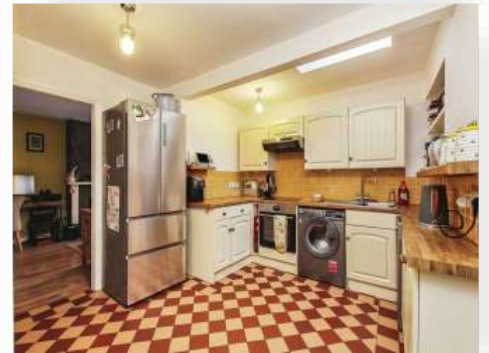
1 Cambridge Road, Stretham ELY CB6 3LP